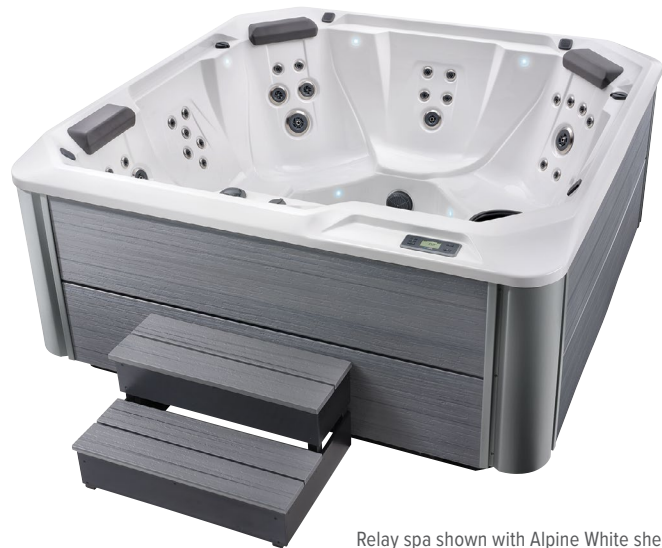
Relay spa shown with Alpine White shell, Storm cabinet and Storm Hot Spot Collection Step.