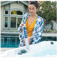
Frog® @ease® In-Line Cartridge Ready